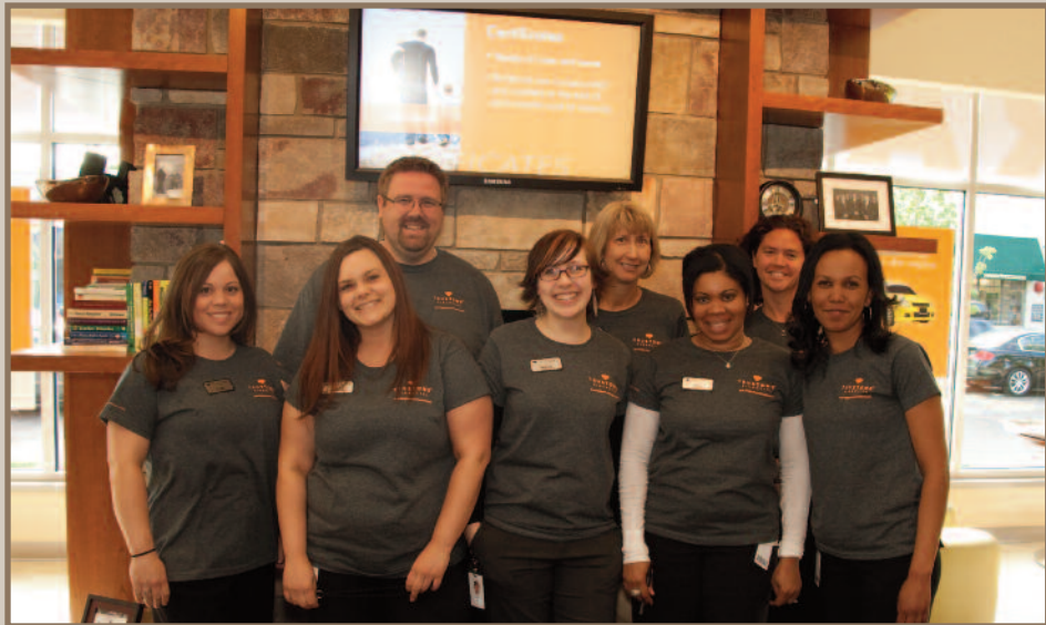
TruStone's Lyn-Lake branch opened in Minneapolis on May 18, 2010.