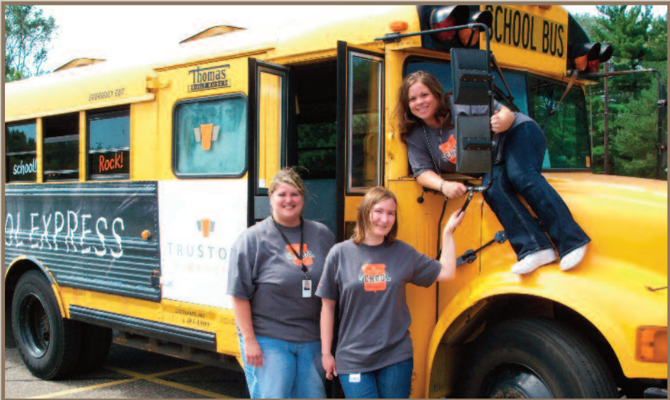
TruStone's School Express Bus collected school supplies for local schools and gave five lucky classrooms a makeover.