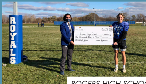
ROGERS HIGH SCHOOL